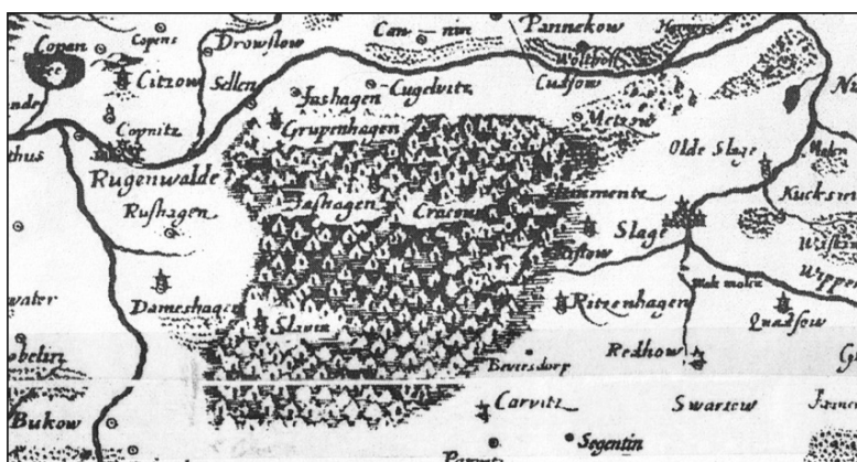
Fig. 2. The surroundings of Mazów (Metzow) and Stary Kraków (Cracow) on the map by Eilhard Lubben (Lubinus) from 1618 (the scale of the original approx. 1:227 000)

Due to the variability of the scale, significant longitude displacement and errors in the location of field facilities, the map by Lubinus cannot be treated as an uncritically reliable source of information about the state of land use, although Plit (2009) made such an attempt. The map was also used by Kunz (2012) and based on it the greatness of the forestation of Western Pomerania was specified. However, this image brings some important information. It can be seen that the area surrounding Stary Kraków was deforested already at the beginning of the 17 th century (Fig. 2), which is confirmed by written sources (Witek and Witek 2009). The deforested area, including the area occupied by villages, according to the authors' estimate, amounted to approx. 315 ha. The Wieprza River was accompanied on the left bank by a strip of deforested land which probably covered the bottom of the valley and river terraces. Forests growing on right-bank river terraces and upland were classified as coniferous forests, and the forest complexes covering left-bank dammed areas as deciduous forests. The area of deciduous forests covering the plains to the south of Stary Kraków was estimated to be 2,374 ha and the area of coniferous forests 72 ha (Table 1).